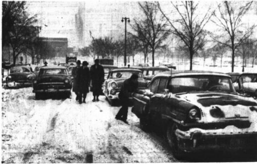
HEAVY SNOW ON W. KILBOURN AV. NEAR THE SARETY BUILDING CAUSED THIS TRAFFIC TIE-UP WEDNESDAY AFTERNOON.